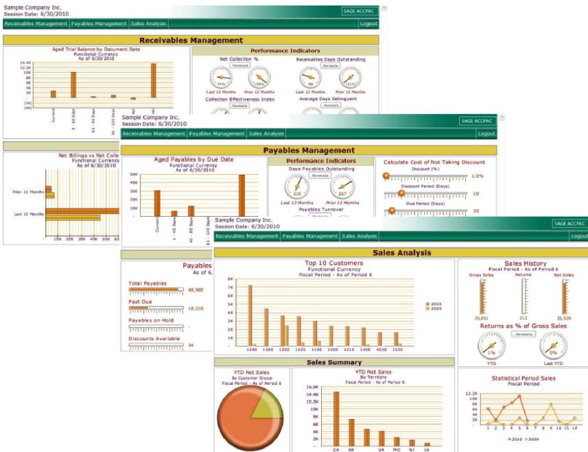
Accounts Payable, receivable and Sales Analysis dashboards